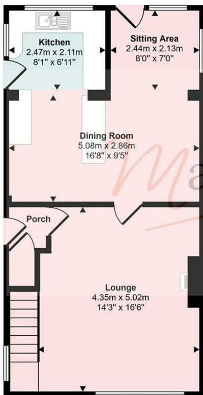
Ground Floor Approx 52 sq m / 564 sq ft